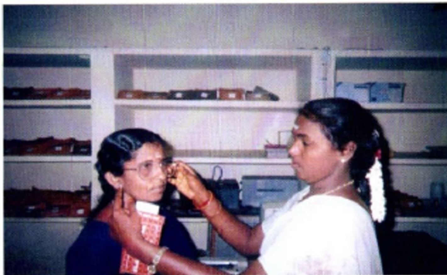
A patient being provided with spectacles