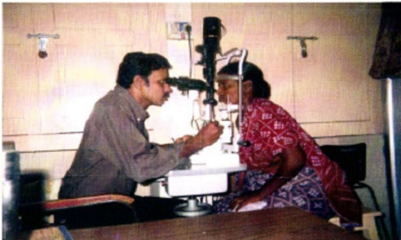
An eye specialist examining a patient

We are sure that these will provide yet another incentive to those friends of the Trust for coming to the Trust's assistance in cash and kind in their endeavour to assist the weaker sections of the community.