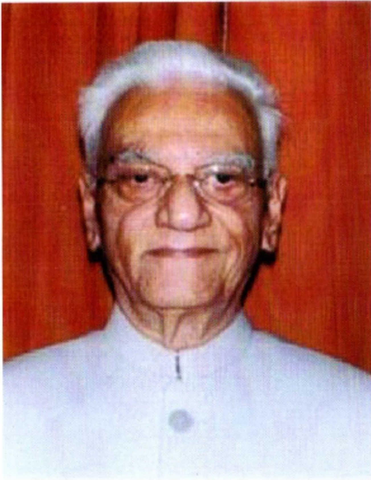
Shri K.R. Malkani, Lieutenant Governor of Pondicherry